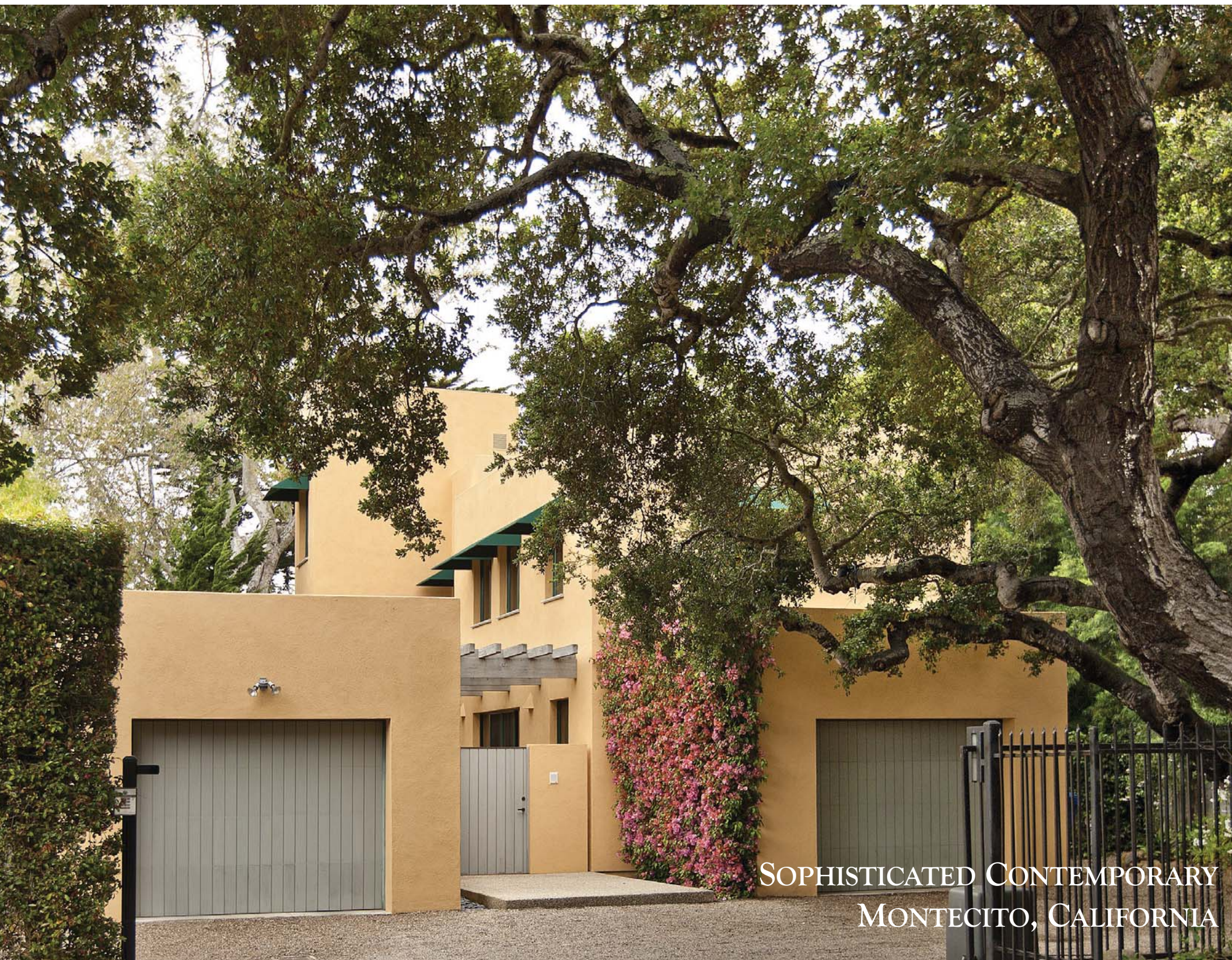
SOPHISTICATED CONTEMPORARY MONTECITO, CALIFORNIA

© 2015 Coldwell Banker Real Estate Corporation. Coldwell Banker is a registered trademark licensed to Coldwell Banker Real Estate Corporation. An Equal Opportunity Company. Equal Housing Opportunity. Owned and Operated by NRT Incorporated. Information presented here is deemed reliable, but not guaranteed.